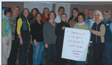
Members of L'Dor v'Dor Northern Michigan Jewish Women's Rural Leadership Consortium